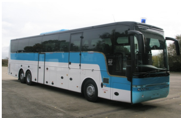
The new Jumbulance at Van Hool's Wellingborough depot. Note position of emergency door (near the rear) and the lift door near the front. The external 'ACROSS' livery was still to be added.

However, in line with the latest design of most UK coaches going to the continent, the emergency door will be on the right-hand side, along with the seats, lift and toilet, so the beds will be on the left-hand side.