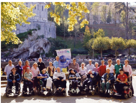
Group 3198 enjoying the Autumn sunshine

National group 3198 brought the 2011 season to a successful conclusion. It also marked the completion of the first decade of Lourdes pilgrimages since ACROSS took over the work originally started by our predecessors, The Across Trust, in 1973.